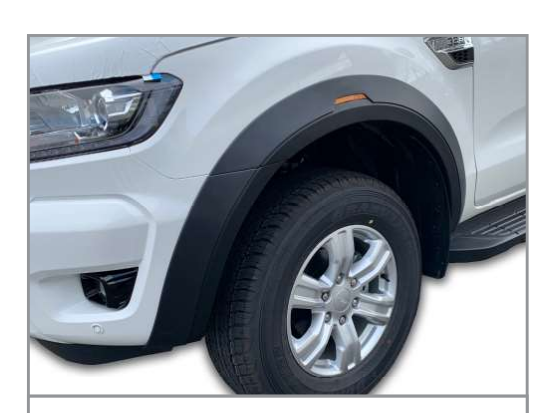
Double Cab Set WITH Reflectors WITH Reflectors # FF428-REFL-MATT