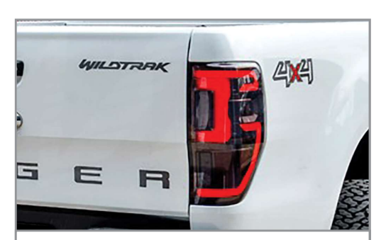
Tail Lamp Assembly Wildtrak 'Smoked Style' # BT235-LHS-LED Left Hand Right Hand #BT235-RHS-LED