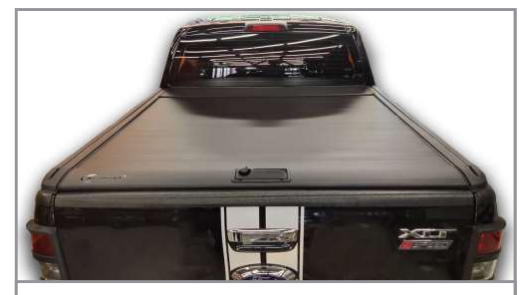
Electric (with remote key) Manual