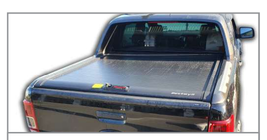
Wildtrak - suits factory sail-plain Electric (with remote key) # RL101E-F Manual # RL101M-F