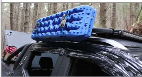
# RT100-BLACK # RT100-PINK # RT100-BLUE