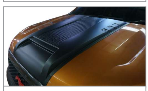
Full Length - Matte Black