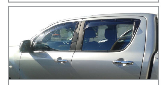
Weather Shields - Large - Double Cab Front Doors (each) # 1201LH / 1201RH Rear Doors (each) # 1220LH / 1220RH