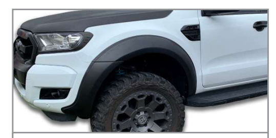
Double Cab Set "Smooth" Finish

6INCH Matt Black # FF417-6INCH-MATT 4INCH Matt Black # FF417-4INCH-MATT 3INCH Matt Black # FF417-3INCH-MATT