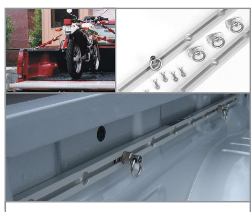
Slide N Lock - Made in the USA # SLIDE68