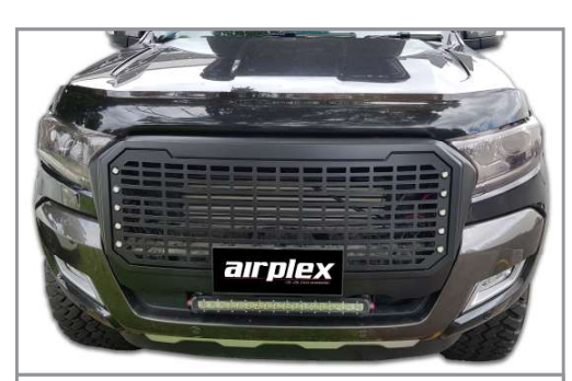
Grille with LED DRL's XL/XLT/Wildtrak Replacement LED's