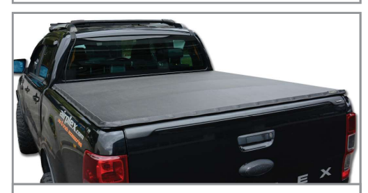
Double Cab #TC108 Double Cab with Cab Protector #TC122 - requires modification to fit with sport bar