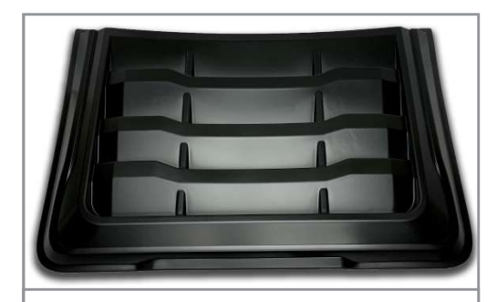
Half Size - Matte Black