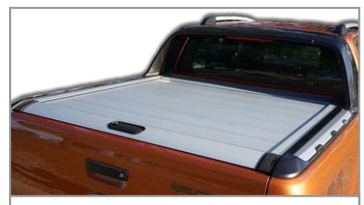
Wildtrak OEM Rolling Lid