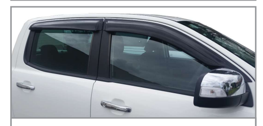
Weather Shields - Slimline Double Cab (set of 4) Single/Xtra Cab (set of 2)