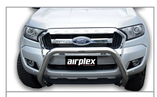
3" Airbag Compliant Stainless Steel # NB149-SS Black Powder Coated # NB149-BLACK - suitable for vehicles WITH parking sensors