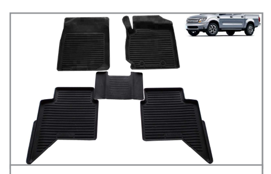
Floor Mats Double Cab (set)