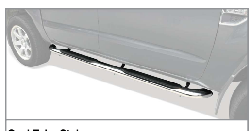
Oval Tube Style Stainless Steel # BT417 Black Powder Coated # BT417-BLACK