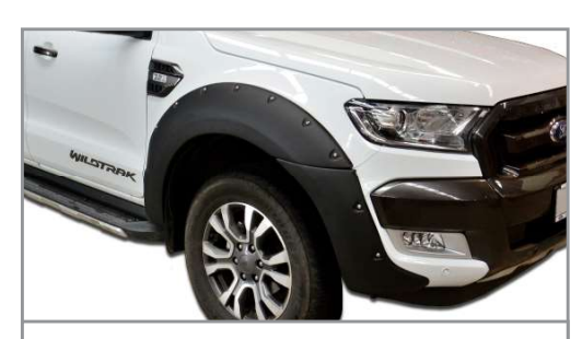
Double Cab Set - "Bolt" Look Matte Black # FF415-6INCH-MATT