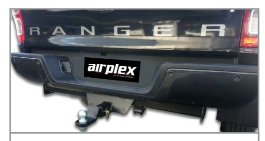
Tow Bar with Removable Tongue Max Rated #TB110