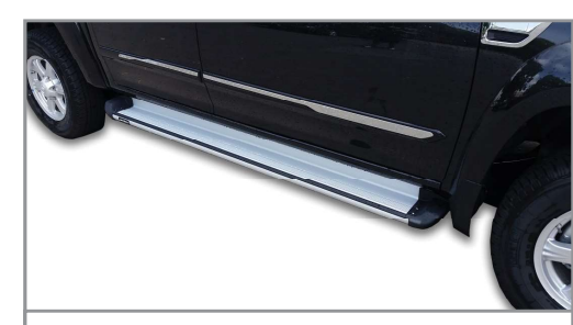
Flat Alloy Silver Alloy # BT420 Black Powder Coated # BT420-BLACK