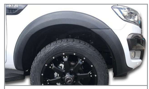
Double Cab Set "Ripple" Finish 4INCH Matt Black Ripple# FF417-4INCH-RPL