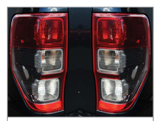
Tail Lamp Assembly Wildtrak 'Smoked Style' # BT235-LHS Left Hand Right Hand # BT235-RHS