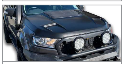
F150 Raptor Style Hood with custom Bonnet Scoop Primed # HOOD001