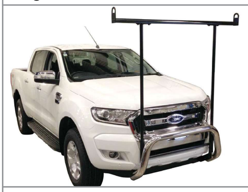
Stainless Nudge Bar/Black "H" Rack XL, XLT & Wildtrak # KNB503-SS