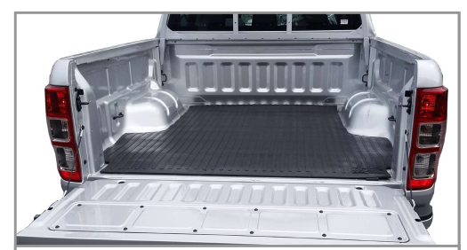
Bed Mat - 6mm Skid & Solvent Resistant Rubber Double Cab #BL404 Super Cab/Xtra Cab #BL411 Single Cab #BL4XX