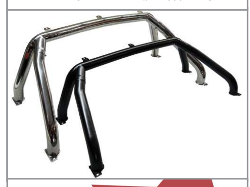
# RB006 # RB006-BLACK