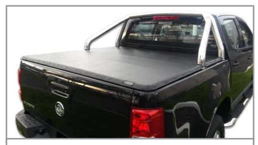
Double Cab #TC109 Double Cab with Cab Protector #TC117 - requires modification to fit with sport bar