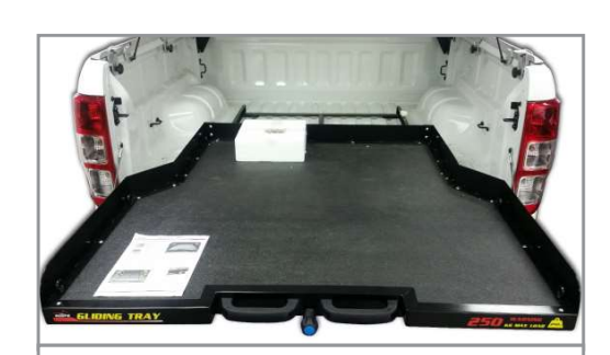
Medium-Heavy Duty -Load rated to 250kg