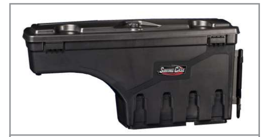
LHS Mounted RHS Mounted