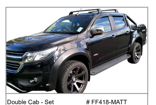
Double Cab - Set