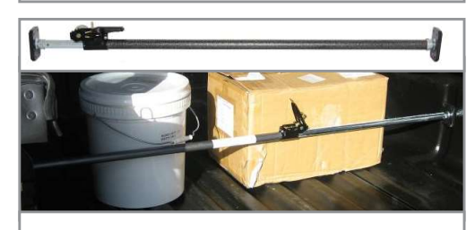
Cargo Bar - Extends 1m-1.8m # CB001