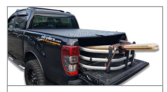
Silver # BE199-SILVER