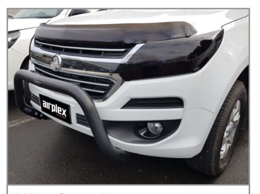
3" Airbag Compatable Black Powder Coated # NB148-BLACK - suitable for vehicles <u>WITH</u> factory parking sensors

3" Airbag Compatable Stainless Steel # NB148-SS - suitable for vehicles <u>WITH</u> factory parking sensors