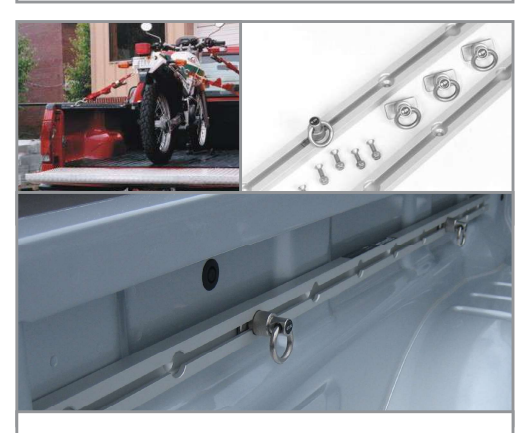
Slide N Lock - Made in the USA # SLIDE68