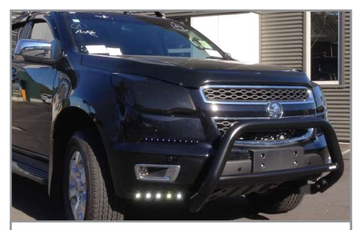
3" Airbag Compatable Black Powder Coated # NB130-BLACK - suitable for vehicles <u>WITHOUT</u> parking sensors