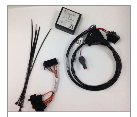
Tow Bar Wiring Plug & Play