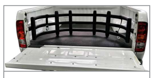
Black # BE199-BLACK