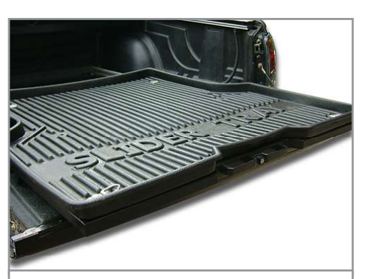
Light Duty -Load rated to 100kg