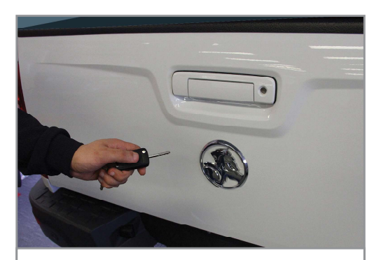
Tailgate Central Locking Kit