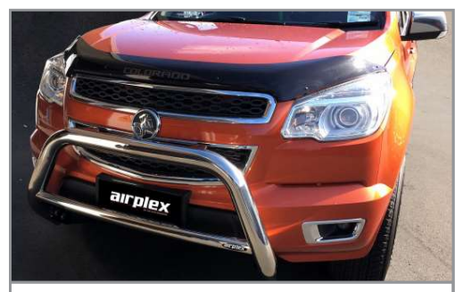
3" Airbag Compatable Stainless Steel # NB130-SS - suitable for vehicles <u>WITHOUT</u> parking sensors