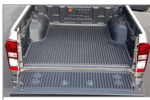
Bed Liner Double Cab