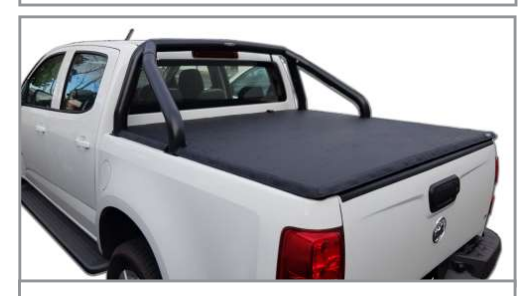
Stainless Steel Black Powder Coated